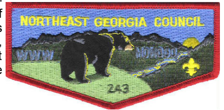
2006 SECTION 6S CONCLAVE