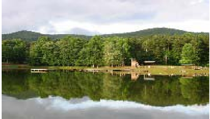
CAMP SIDNEY DEW — WAGULI LODGE

START PLANNING NOW FOR THE 2007 CONCLAVE TO BE HELD AT CAMP SIDNEY DEW OUTSIDE OF CALHOUN, GEORGIA. THIS IS THE CAMP FOR THE NORTHEAST GEORGIA COUNCIL AND HOME TO WAGULI LODGE. WAGULI WILL BE HOSTING THE 2007 CONCLAVE AND IT IS SURE TO BE AN OUTSTANDING EVENT. MAKE PLANS TO ATTEND — THIS IS ONE WEEK-END YOU DO NOT WANT TO MISS. MORE INFORMATION WILL BE FORTHCOMING IN FUTURE TALKING LEAVES AND ON THE TALI WEB SITE.